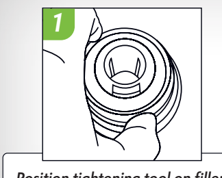
Position tightening tool on filler.